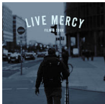
Live Mercy 73K