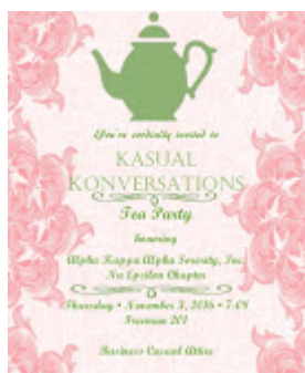
Alpha Kappa Alpha 176K