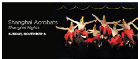
Shanghai Acrobats 132K