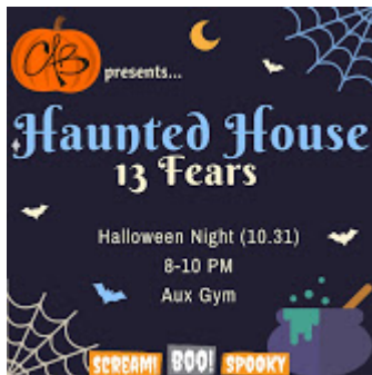
CAB Haunted House.jpg 248K