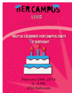
Her Campus 742K