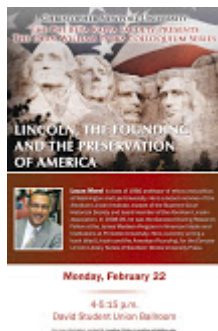
Lincoln Scholar 705K