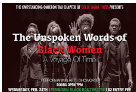
Delta Sigma Theta: The Unspoken Words of Black Women 127K