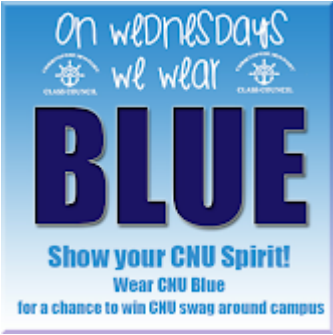
We Wear Blue 179K