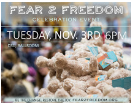
Fear2Freedom_Celebration Night_CNU FLYER 2015.jpg 378K