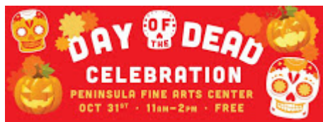
Day of the Dead.jpg 43K