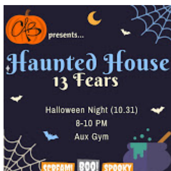
CAB Haunted House.jpg 248K