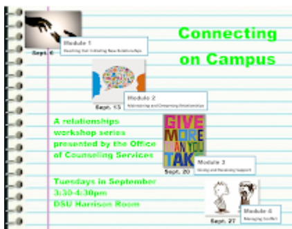
Connecting on Campus.png 3610K