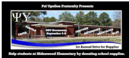
Psi Upsilon Drive.jpg 53K