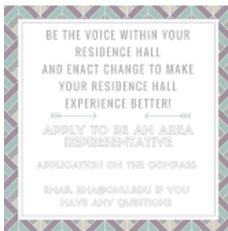
RHA Area Representative Flyer 223K