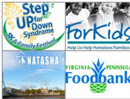
REACH Fall Break 175K