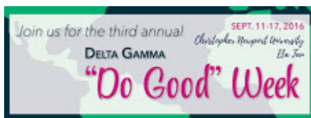
DG Do Good Week.jpg 30K