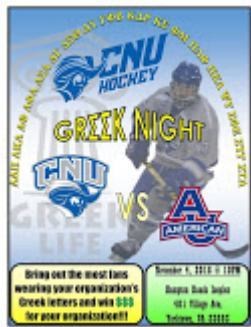
Hockey 11/4 132K