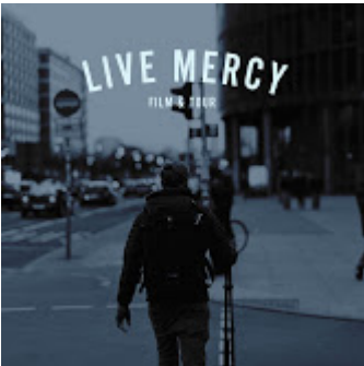
Live Mercy 73K