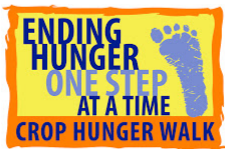
Crop Hunger Walk 946K