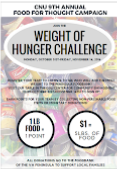
Weight Hunger Challenge 363K