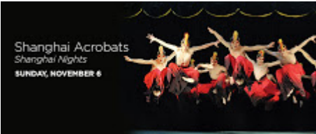
Shanghai Acrobats 132K