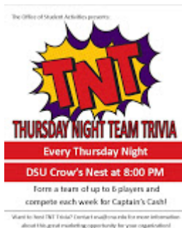
TNT Trivia 87K