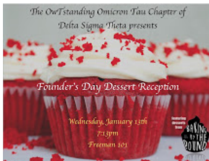
Delta Sigma Theta 146K