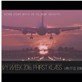
AKA Phirst Klass 52K

Follow us on Twitter @CNUOSA or like the CNU Office of Student Activities on Facebook!