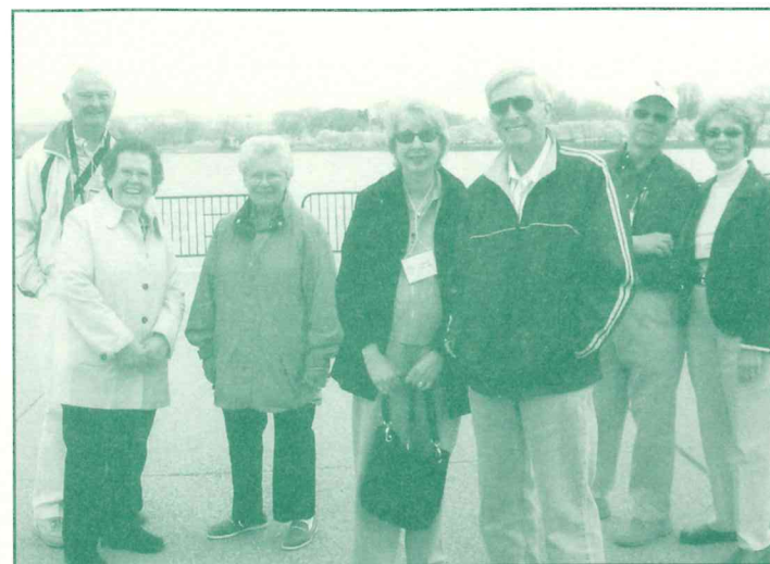
Tidal Basin, Washington, D.C.

On Tuesday, we depart for Winston-Salem, where we enjoy an afternoon guided tour of Reynolda House, the R.J. Reynolds mansion and art museum. After an overnight, we visit the Winston-Salem Visitor's Center; take a guided tour of Bethabara Park, the oldest Moravian community in the U.S.; lunch in the Old Salem Tavern with time to browse Old Salem, including admission to the Toy Museum. After a full five days of touring the new South, we depart for home in mid-afternoon.