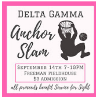
Delta Gamma's Anchor Slam 63K