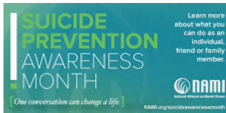
NAMI Suicide Prevention Awareness.jpg 68K