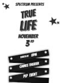
Spectrum Presents: New Life 117K