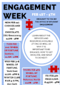
Engagement Week 620K