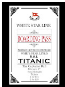
Captain's Ball 120K