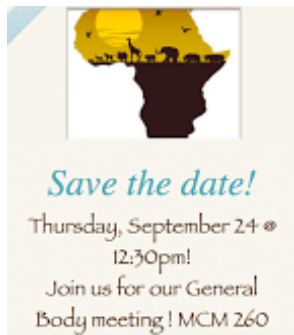
ASU_General Body Mtg.png 294K