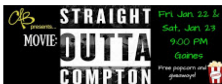
CAB Strait outta compton 95K