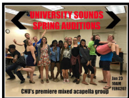
University Sounds Spring Additions 212K