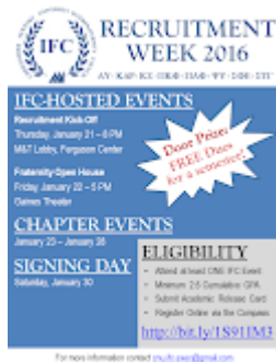
IFC Recruitment 97K