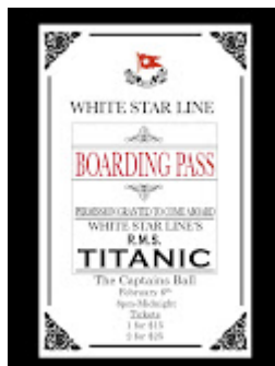
Captain's Ball 120K