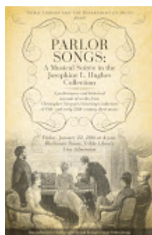
Parlor Songs 153K