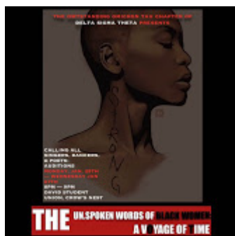
Delta Sigma Theta 52K