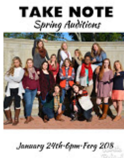
Take Note Auditions 486K