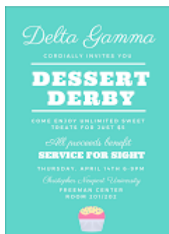
Delta Gamma's Dessert Derby 104K