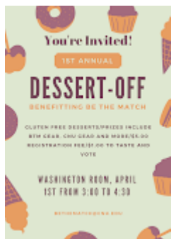
Be the Match Dessert Bake-off 464K