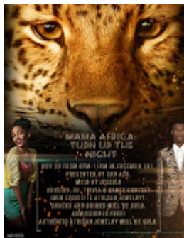
African Student Union Events 1525K