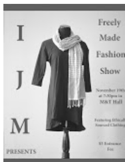
Freely Made Fashion Show 2050K