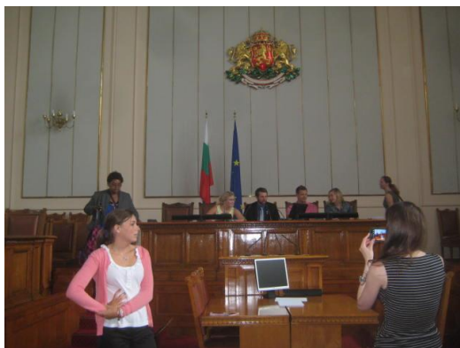
2014 students in Bulgaria's Parliament Building