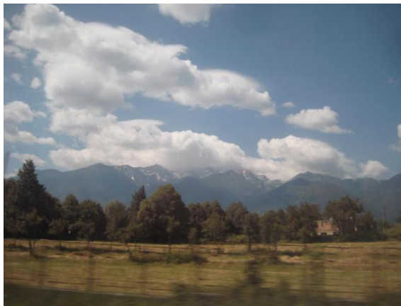
"Balkans" means "Mountains"

DON'T MISS OUT! Once you apply & are accepted (First come; first served!) a $500.00 deposit reserves your spot.