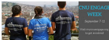
CNU Engage_cover_photo2.jpg 88K