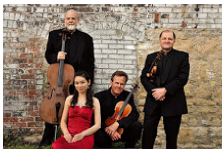
Amara Piano Quartet 91K