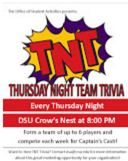
TNT Trivia 87K