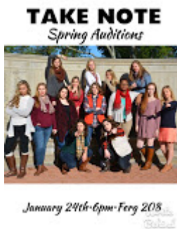
Take Note Auditions 486K