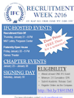
IFC Recruitment 97K