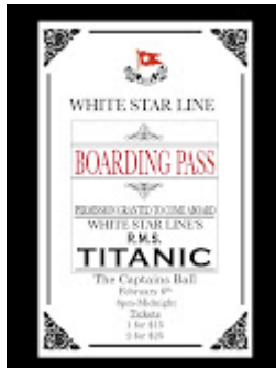
Captain's Ball 120K