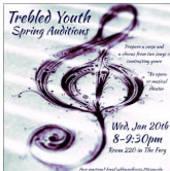
Treble Youth 110K