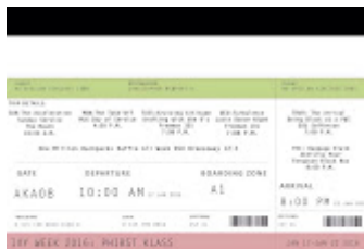
Alpha Kappa Alpha Ivy Week 48K