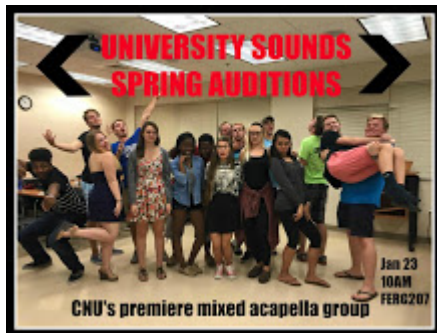
University Sounds Spring Additions 212K