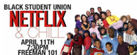
BSU Netflix and Chill 110K