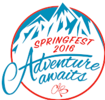
Spring Fest 183K