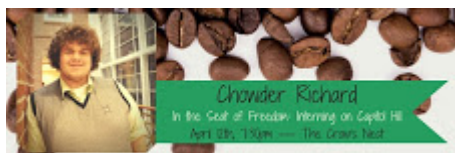
PLP Coffeehouse 104K