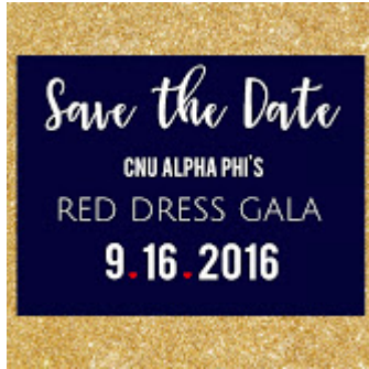
Red Dress Gala.jpg 461K