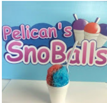
Hypnotic Control Fundraiser.jpg 59K