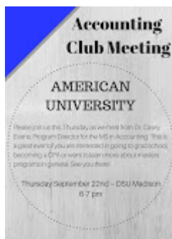
Accounting Club 219K