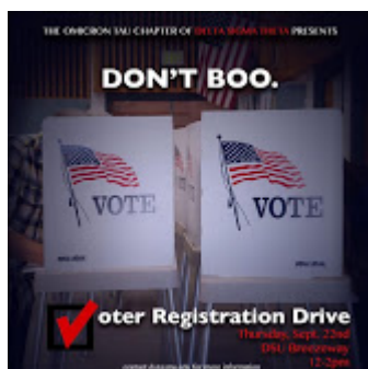
Voter Registration Drive