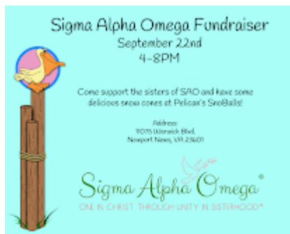
Sigma Alpha Omega Fundraiser 145K