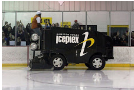
Ice Skating with CAB 66K