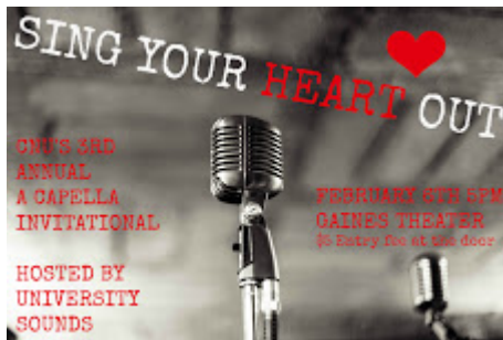
Sing Your Heart Out 1672K