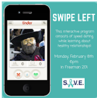
S.A.V.E Swipe Left 349K