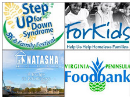
REACH Fall Break 175K