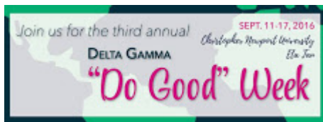
DG Do Good Week.jpg 30K