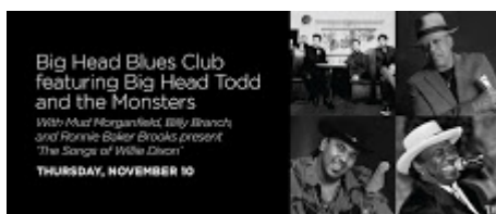
Big Head Todd 70K