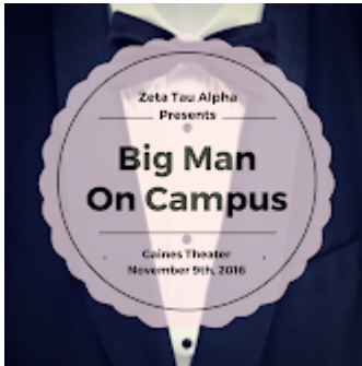
ZTA Big Man on Campus 382K