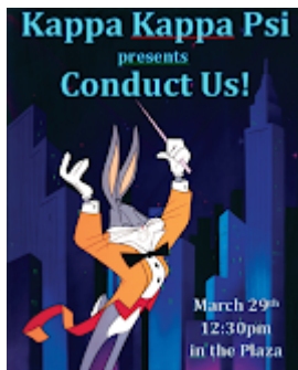
Conduct Us 469K