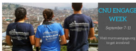
CNU Engage_cover_photo2.jpg 88K