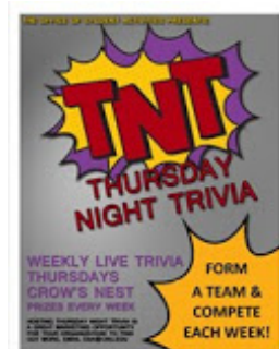
TNT Trivia_general.jpg 18K