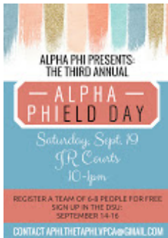
Alpha Phield Day.jpg 1199K