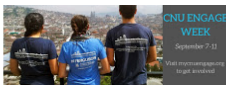
CNU Engage_cover_photo2.jpg 88K