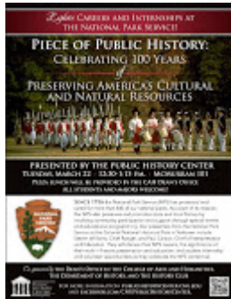
National Park Service 460K