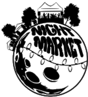
Night Market 410K