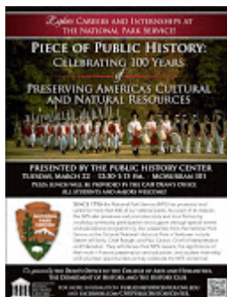
National Park Service 460K