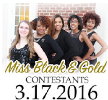
Miss Black and Gold 271K