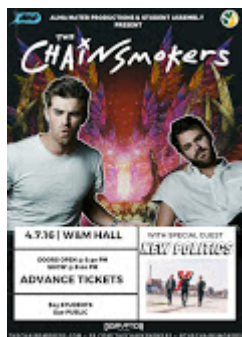
The Chainsmokers 134K