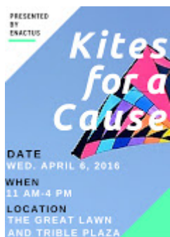
Kites for a Cause 1013K