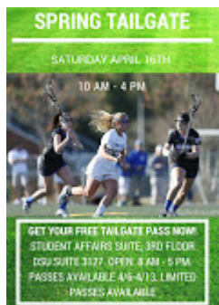
Spring Tailgate 3206K