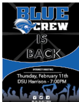
Blue Crew 528K