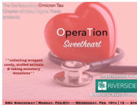
Operation Sweetheart 43K