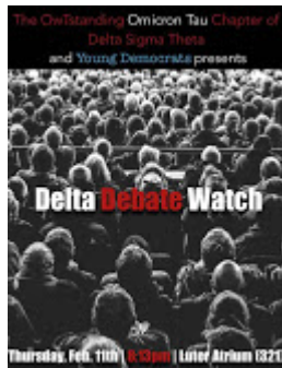
Delta Debate Watch 96K