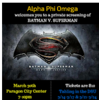
Alpha Phi Omega Ticket Sales 823K