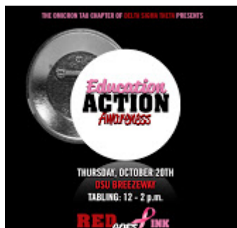
Education Awareness 231K