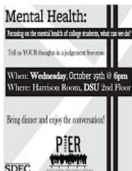
Pier Perspective 756K