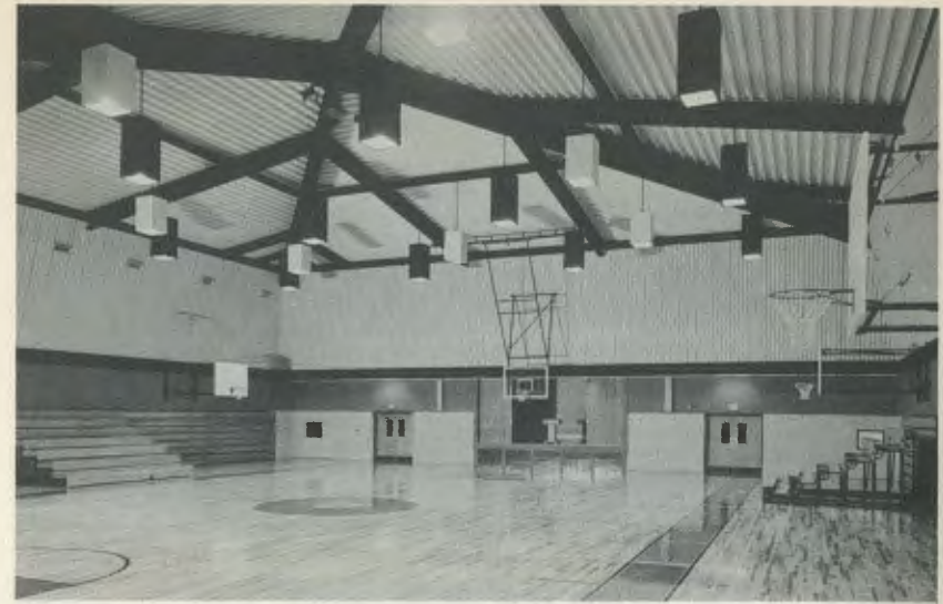
RATCLIFFE GYMNASIUM—INTERIOR SHOT

Monday-Thursday —8:00 a.m. to 9:45 p.m. Friday —8:00 a.m. to 5:00 p.m. Saturday —8:00 a.m. to 12:00 noon Sunday —1:00 p.m. to 5:00 p.m.