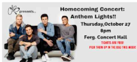
CAB presents... Anthem Lights 557K