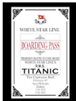
Captain's Ball 120K