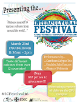
Intercultural Festival 384K

Follow us on Twitter @CNUOSA or like the CNU Office of Student Activities on Facebook!