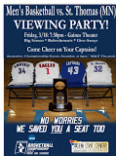
Viewing Party 272K