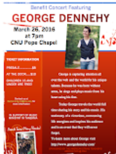
Benefit Concert 246K