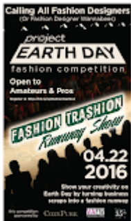
Project Earth Day 901K