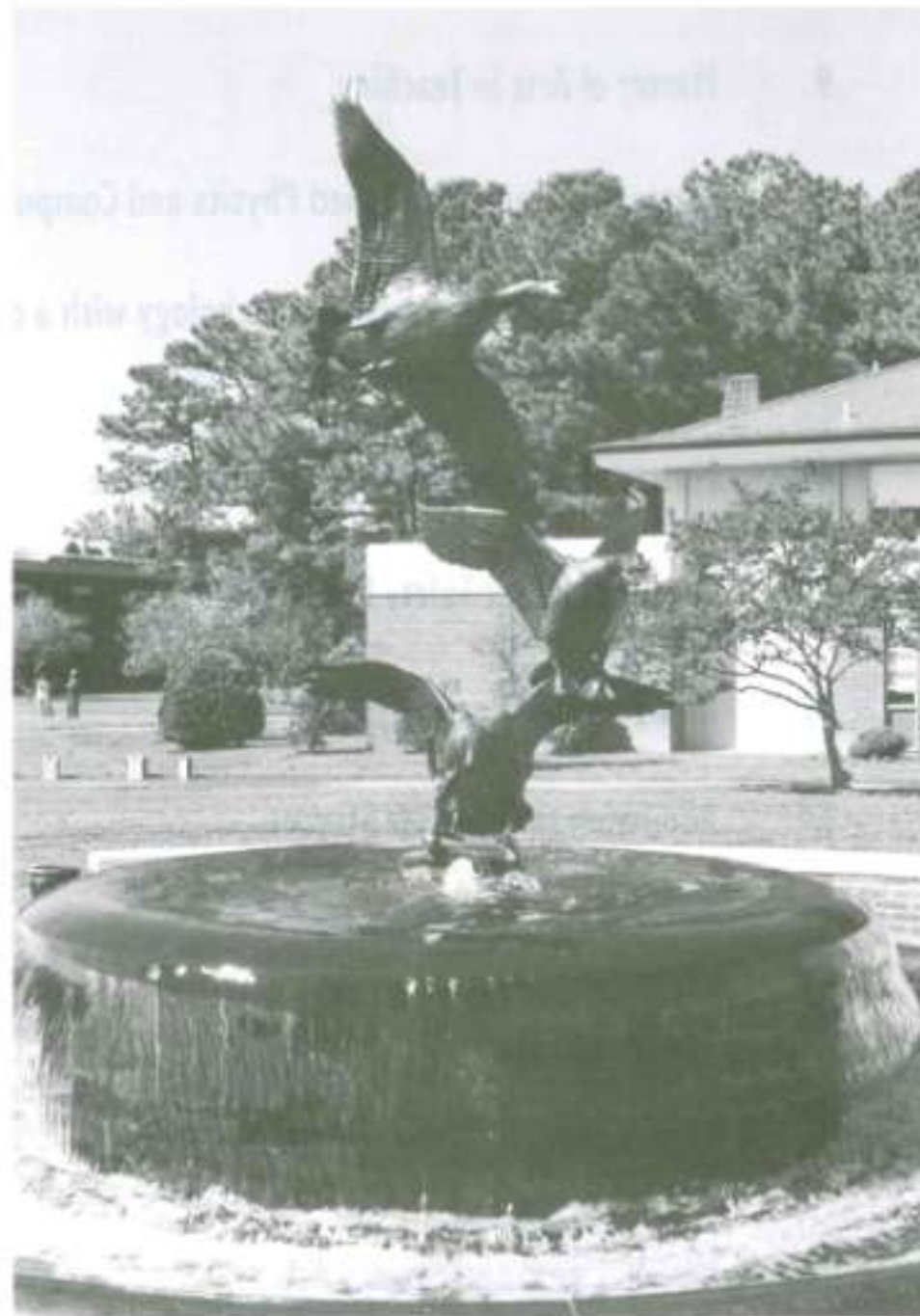
Fountain on Saunders Plaza.