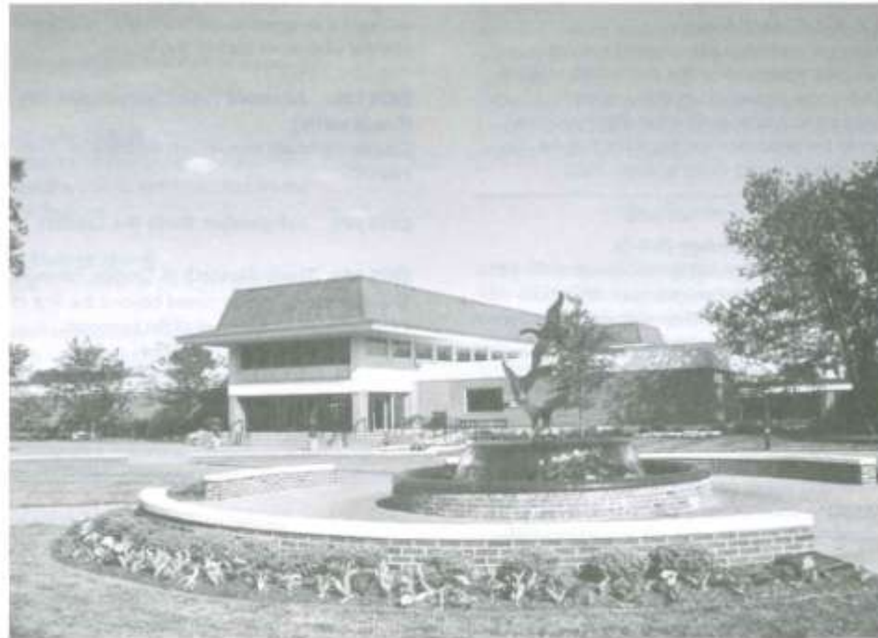
Captain John Smith Library.