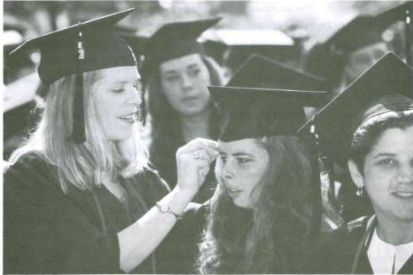
MAT graduates at the May 2000 Commencement.