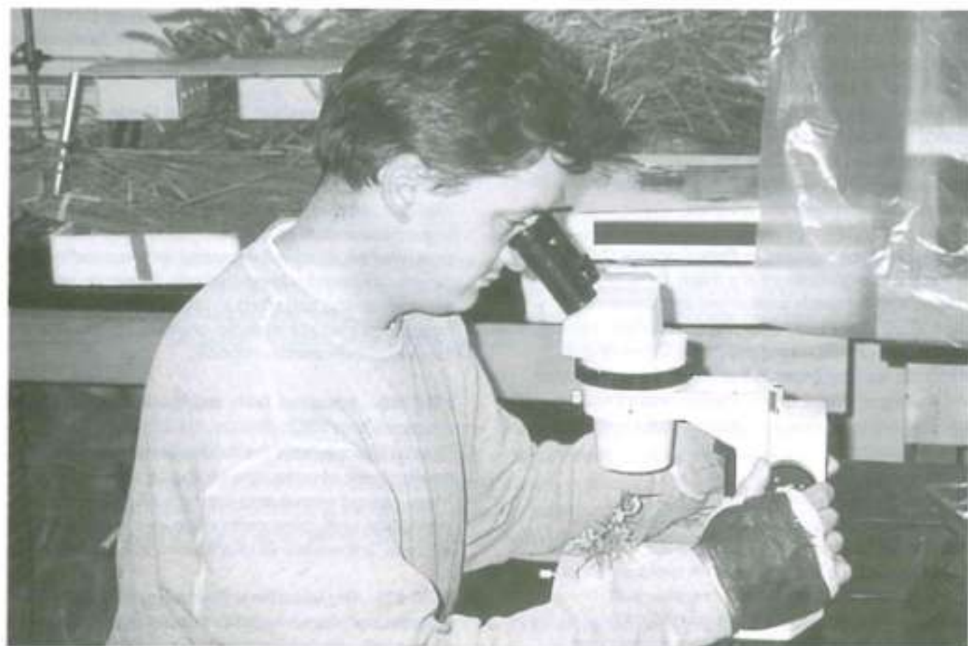
Graduate student in the M.S. in Environmental Science program.