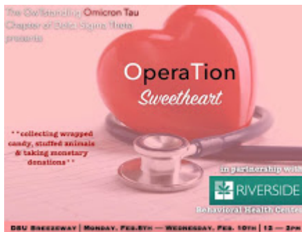
OperaTion Sweetheart 43K