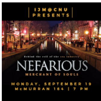
IJM Nefarious.png 652K