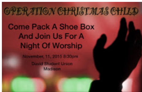
Worship and Operation Christmas Child.jpg 686K