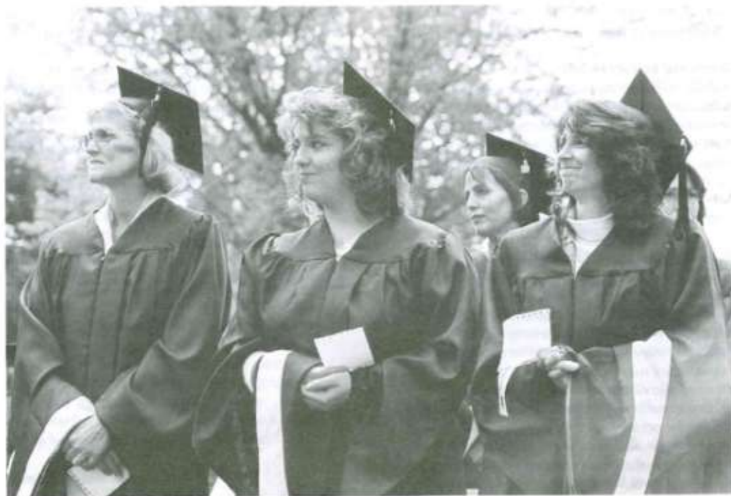
Graduates of a master's degree at the May 1999 Commencement.