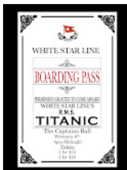
Captain's Ball 120K