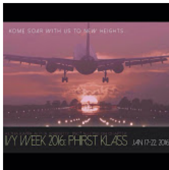
AKA Phirst Klass 52K