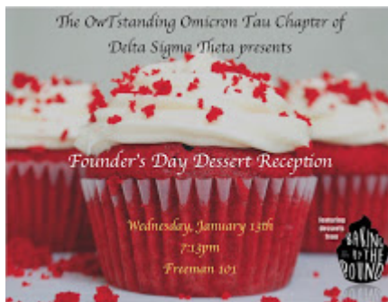
Delta Sigma Theta 146K