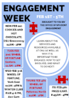
Engagement Week 620K