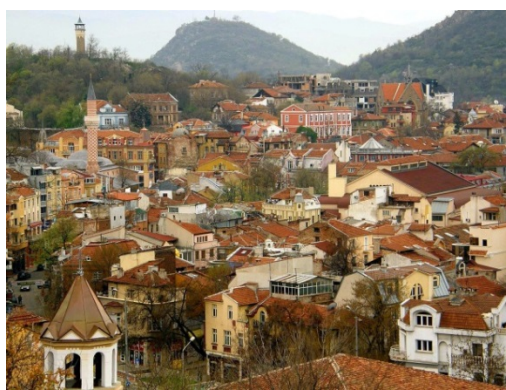
Minarets and Mountains: Plovdiv, Bulgaria