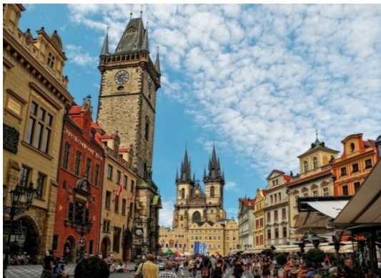
Prague: Old Town Square

...to sign up for an unforgettable study abroad experience in BULGARIA—HUNGARY—AND THE CZECH REPUBLIC