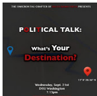
Political Talk 40K