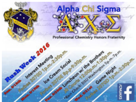
alpha chi sigma recruitment.jpg 82K