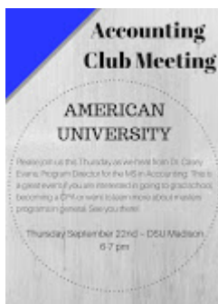
Accounting Club 219K