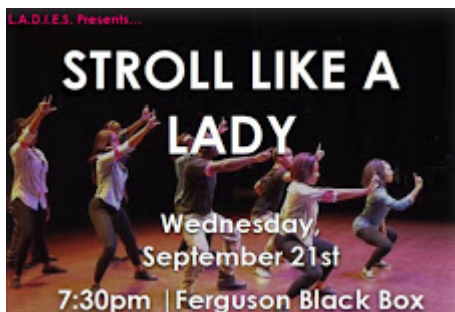
Stroll Like a Lady.jpg 42K