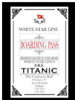
Captain's Ball 120K