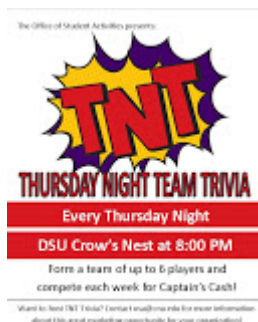
TNT Trivia 87K