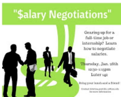
Salary Negotiation 267K