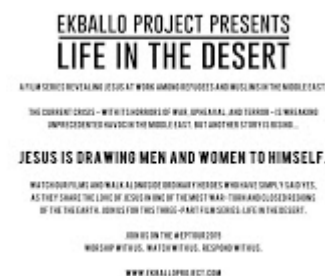
Life in the Desert.jpg