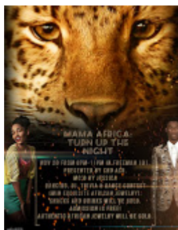
African Student Union.jpg 1525K